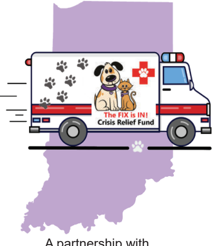
A partnership with Public Vet Mobile Clinic