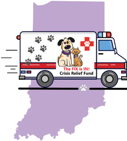
A partnership with Public Vet Mobile Clinic